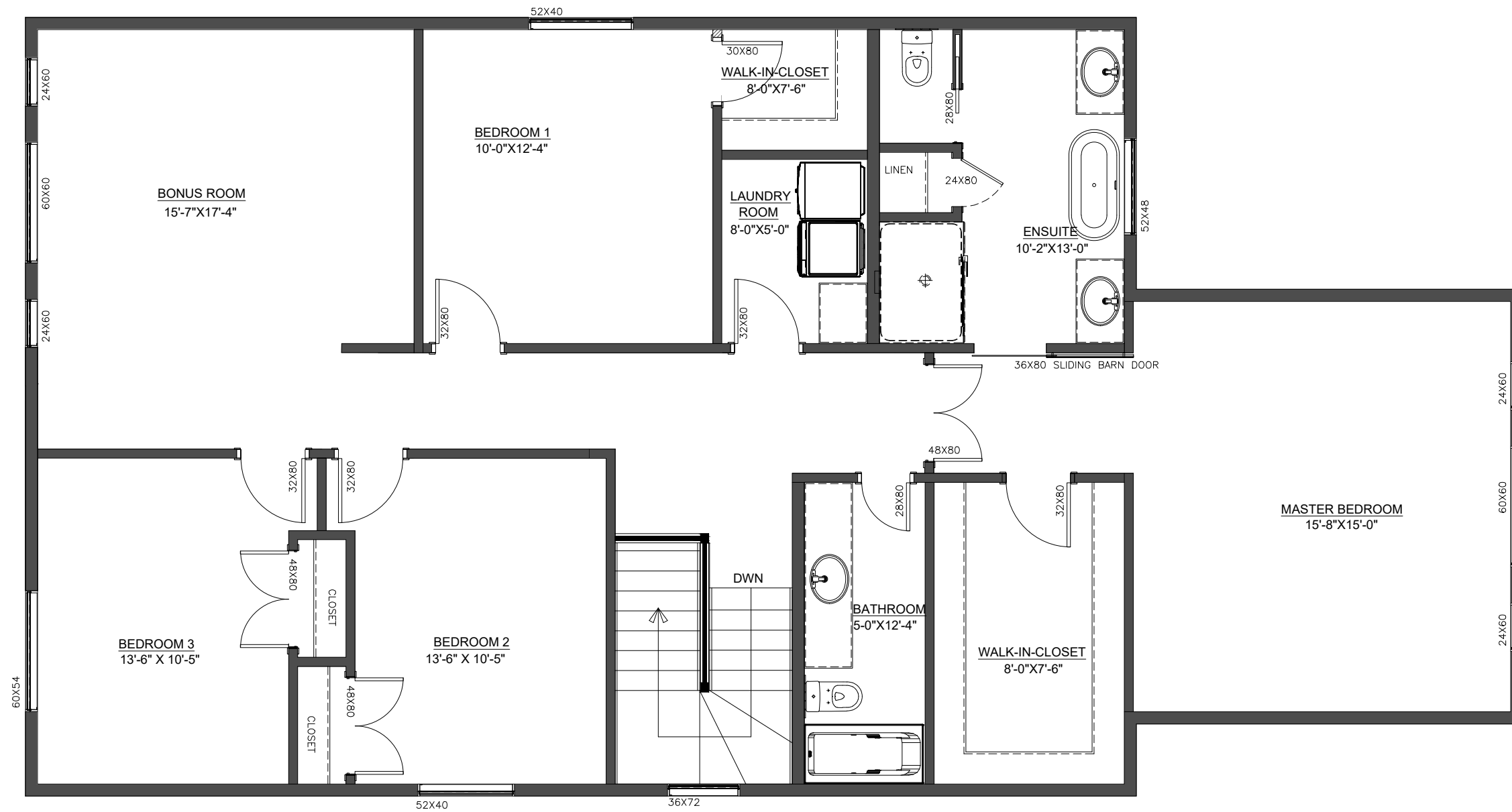
1 UPPER FLOOR PLAN 1625 sqft SCALE: 3/16"=1'-0"